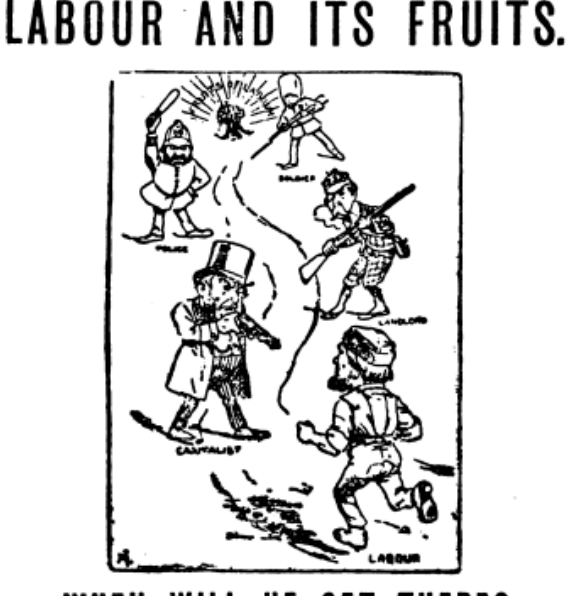
WHEN WILL HE GET THERE?